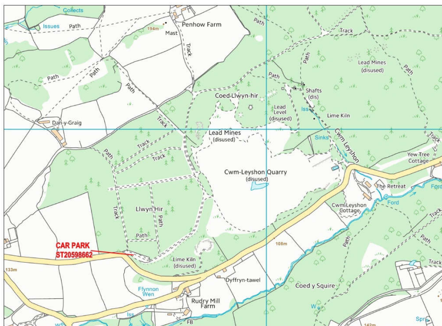
This map is reproduced from Ordnance Survey material with the permission of Ordnance Survey on behalf of the Controller of HMSO © Crown copyright. Unauthorised reproduction infringes Crown copyright and may lead to prosecution or civil proceedings. Ordnance Survey. Licence number 100043138 (2016).